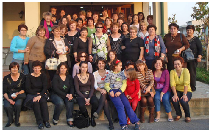
Empowerment, networking and finding new contacts is important.

"Empowerment! That is so, so important! Then it is networking and finding new connections. What we do will be based on the future hopes of the women. We will have future workshops to improve the ideas. This is a method to for planning and forming a vision of the future. Workshops help define aims and identify problems. We also want to improve some