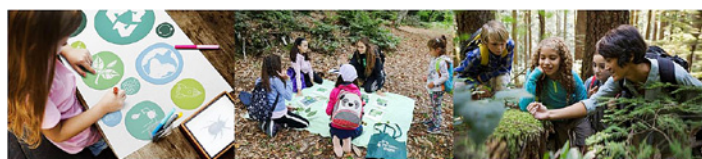
A group of younger women in the rural areas of Thessaloniki started Eco Routes. They offer walking tours in the forests and mountains.

"They could not open for tourists this year but hope it will be possible in 2022. For tourists it's not easy to find hikes like this on their own so I think it can be a success. This year, during the pandemic, they have arranged Saturdays in the forests for families with children between six and ten. There were some learning activities for both children and adults and games for everyone. Each family paid a small fee and it worked out very nicely."