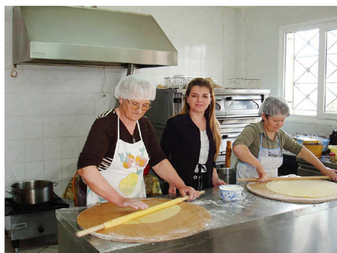
Several cooperatives were successful turning baking into a serious business.