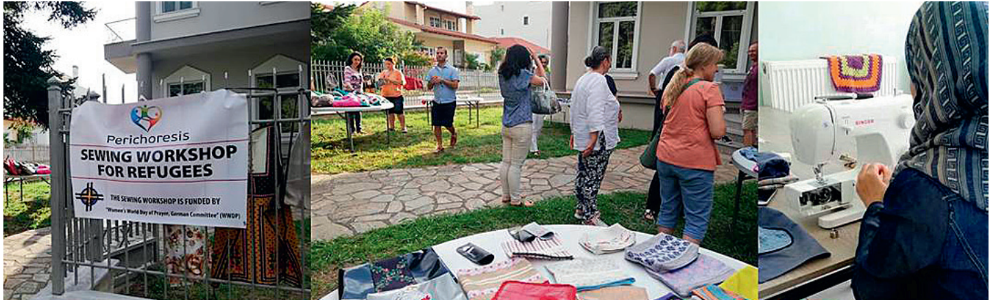
In Katerini the cooperative Peri Ergon works with both refugees and unemployed Greek persons.

In Katerini the cooperative Peri Ergon www.periergon.gr works with refugees and unemployed Greek persons.